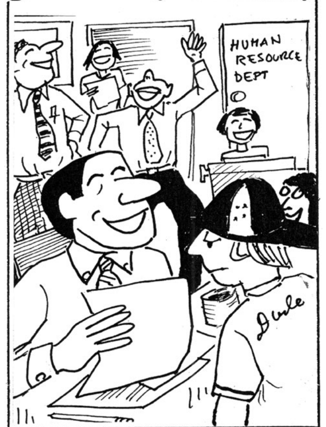
"There are no openings right now, but your resume really cracked us up."